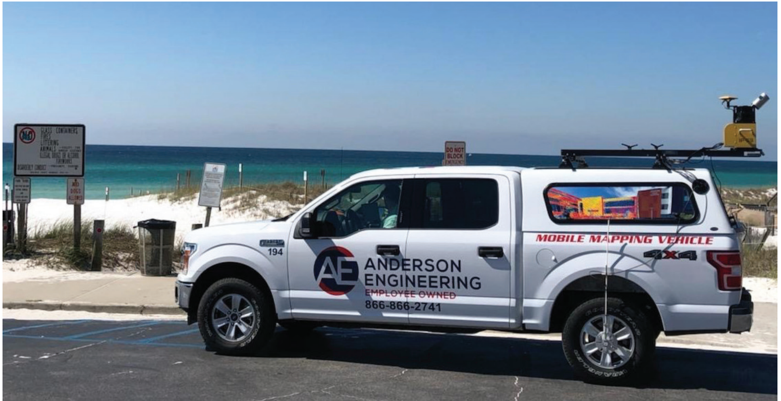
Example of a Mobile LiDAR unit vehicle setup